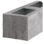
Punta de cruz