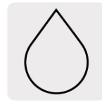
Para cortes en húmedo