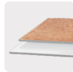
Loseta y azulejo