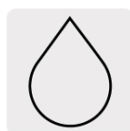
Para cortes en húmedo