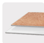
Loseta y azulejo